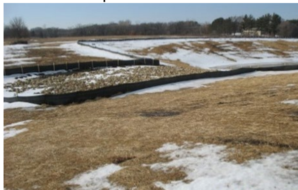
Silt fence used as perimeter control

Perimeter control is a category of sediment control best management practices (BMPs) that act as barriers to retain sediment on a construction site. Sediment control BMPs are intended to slow and hold flow, filter runoff, and promote the settling of sediment out of runoff via ponding behind the sediment control BMP.